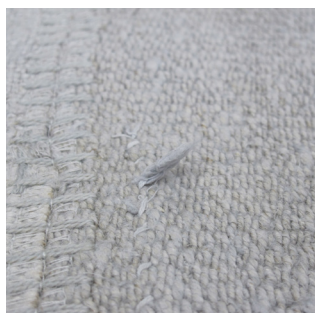
Woven small bows